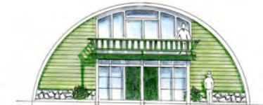
15 PANEL W/LOFT