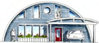
16 PANEL W/LOFT/CAR PORT

Lower Ownership Cost - Rugged & Fast Construction - Low Energy & Maintenance - Unlimited Interior & Exterior Design Possibilities - Smaller Enviromental Footprint - Higher Long Term Resale Value & ROI