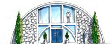
15 PANEL W/LOFT

Experience What A True 21st Century "Ultra-High Performance Home" Feels Like!