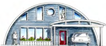
16 PANEL W/LOFT/CAR PORT

Lower Ownership Cost - Rugged & Fast Construction - Low Energy & Maintenance - Unlimited Interior & Exterior Design Possibilities - Smaller Enviromental Footprint - Higher Long Term Resale Value & ROI