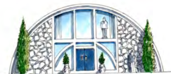
15 PANEL W/LOFT

Experience What A True 21st Century "Ultra-High Performance Home" Feels Like!