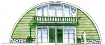
15 PANEL W/LOFT