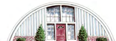
13 PANEL BUNGALOW